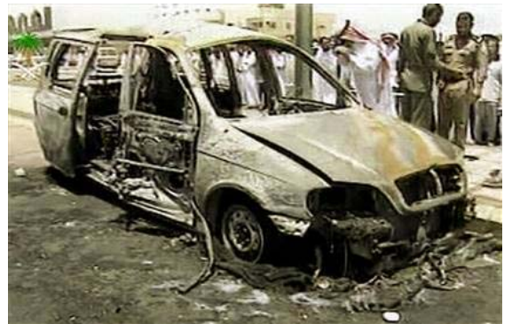
[Top]: Saudi anti-terrorist commandos storm a housing complex for Western oil workers in Khobar seized by Al-Qaida gunmen in May 2004.